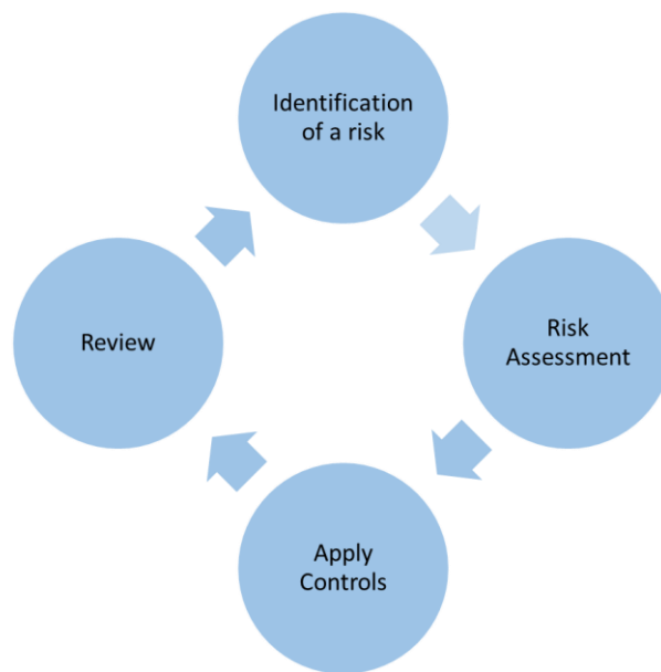
Figure 2 – Risk Assessment Process