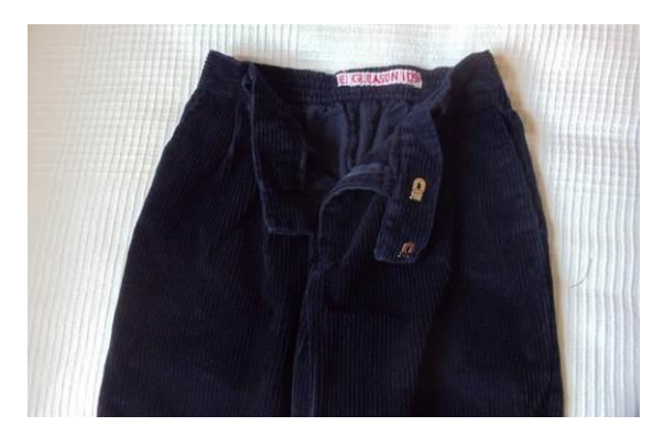
Navy cord shorts and trousers – sew a nametape on the INSIDE of the waistband

SPORTS SHOES – mark the back of the heel on the OUTSIDE of the trainers, sports hall shoes, rugby boots and wellington boots with your son's school number. Also mark with the sticky shoe label on the inside