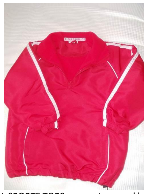
ALL SPORTS TOPS – nametape and loop sewn on the INSIDE of the collar