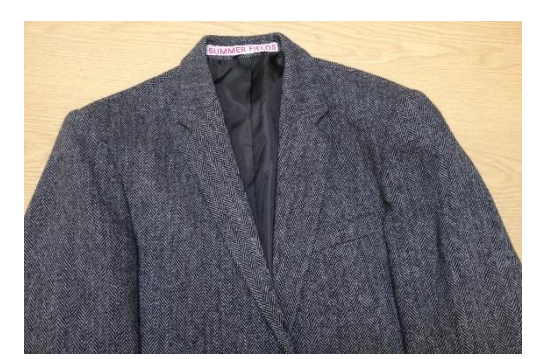
Jackets - sew a nametape on the INSIDE of the collar