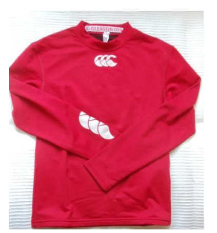
Skins – sew a nametape and loop INSIDE