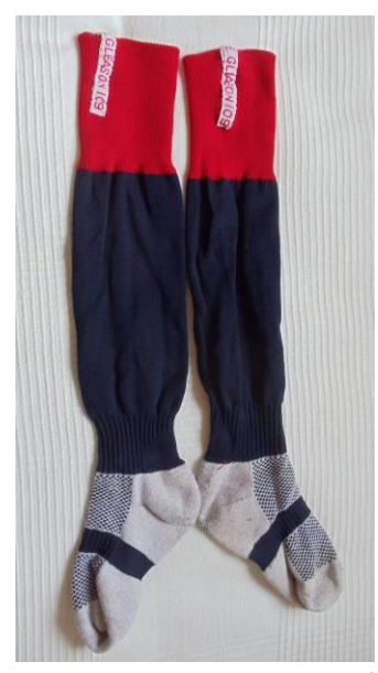
Socks – sew a nametape as shown. White and grey– sew on the INSIDE Games socks - sew on the OUTSIDE (see picture above)