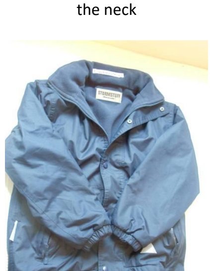
Coats – sew a nametape on the INSIDE of the collar