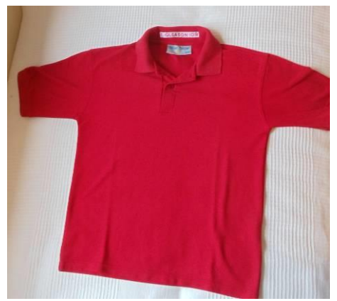
All school shirts – sew a nametape on the INSIDE of the collar