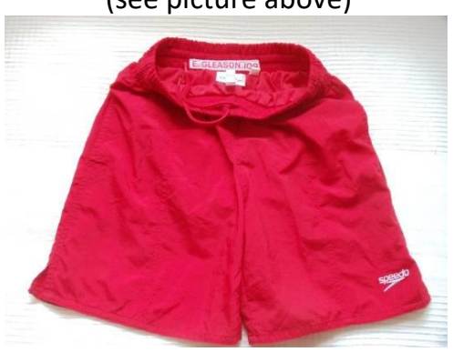
Swimming trunks – sew the nametape and loop on the INSIDE of the waistband