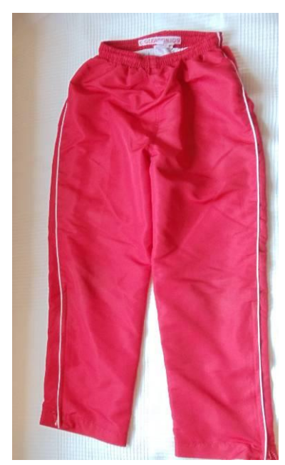
Tracksuit bottoms – sew a nametape and loop on the INSIDE of the waistband